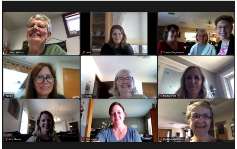
NDMTA Conference Attendees on Zoom Call