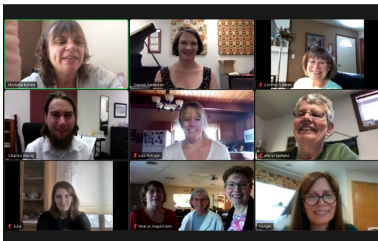
NDMTA Conference Attendees on Zoom Call

Our bylaws state that our nominating committee should consist of 3 members