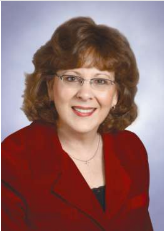
“The Well-Balanced Musician: Teacher and Student”