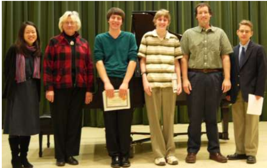
Participants and teachers at the NODAK Competition