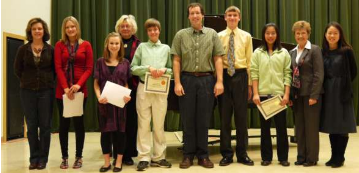
Participants and teachers at the NODAK Competition