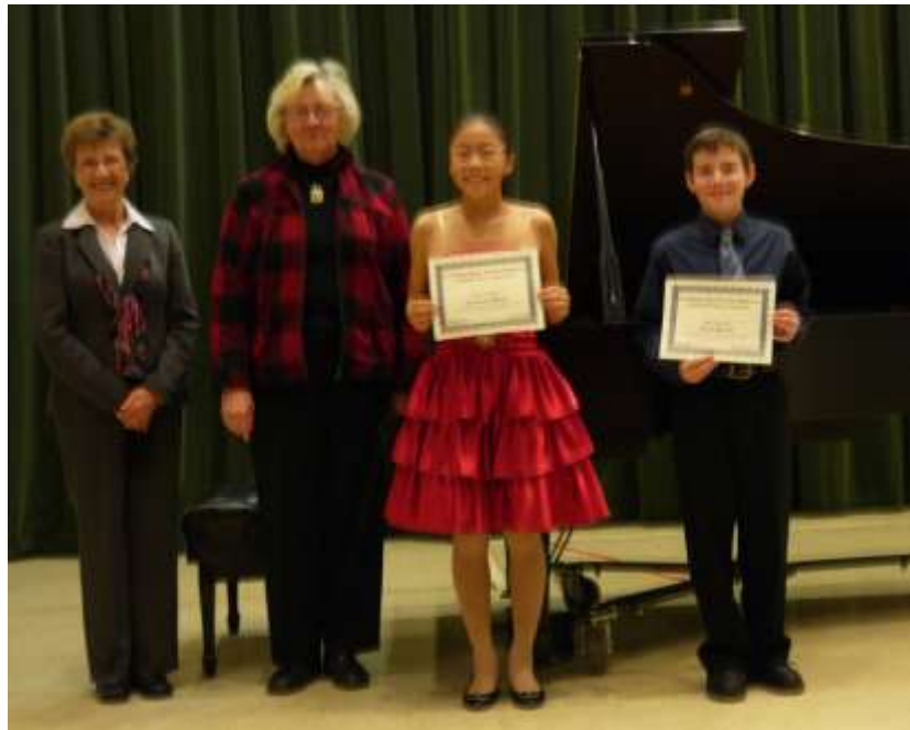
Participants and teachers at the NODAK Competition