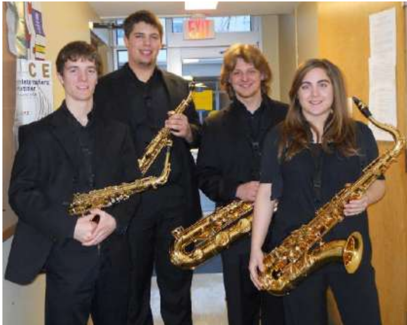
Gold Star Quartet (Chamber Music Ensemble)

It will certainly be an exciting final competition at the National Conference in Albuquerque!