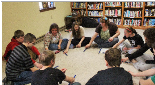
Latin Game Activities