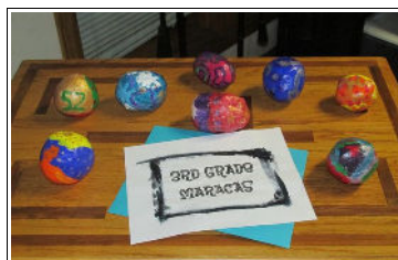
Pottery created by the Langdon Area Public Schools, which was displayed throughout the festival