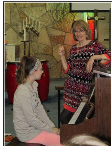
Premiere rehearsal of the commissioned piece, "Tango Lights Celebration"