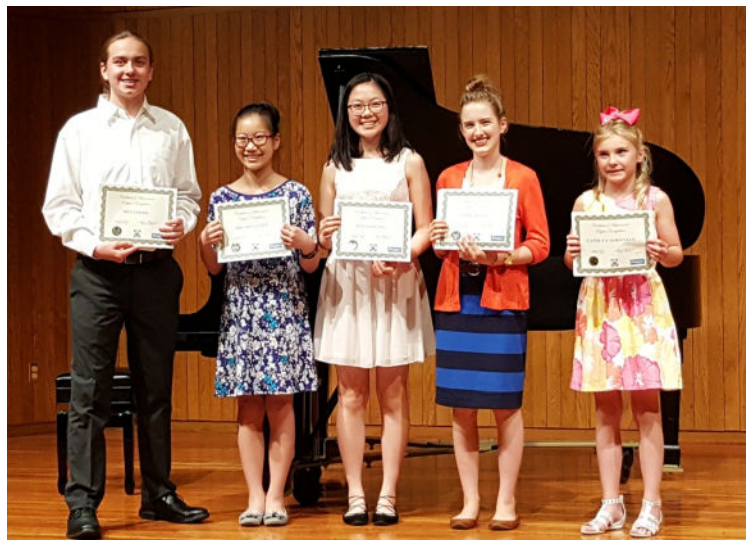
Popplers Competition Participants