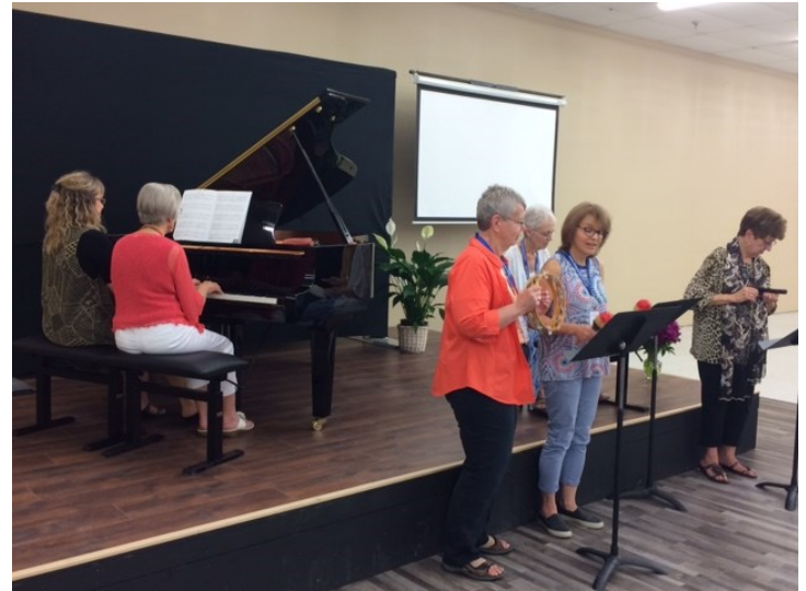
Performing "Tango Lights Celebration"

Wynn-Anne emphasized that music is fusion and music has many common roots. Latin music has grown from the music of indigenous people of South America, Spanish music, and the infusion of European culture. Jazz has a large background that comes from the African slaves, and is also affected by European and indigenous cultures.