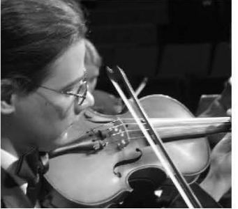
We have a place for your students and you!